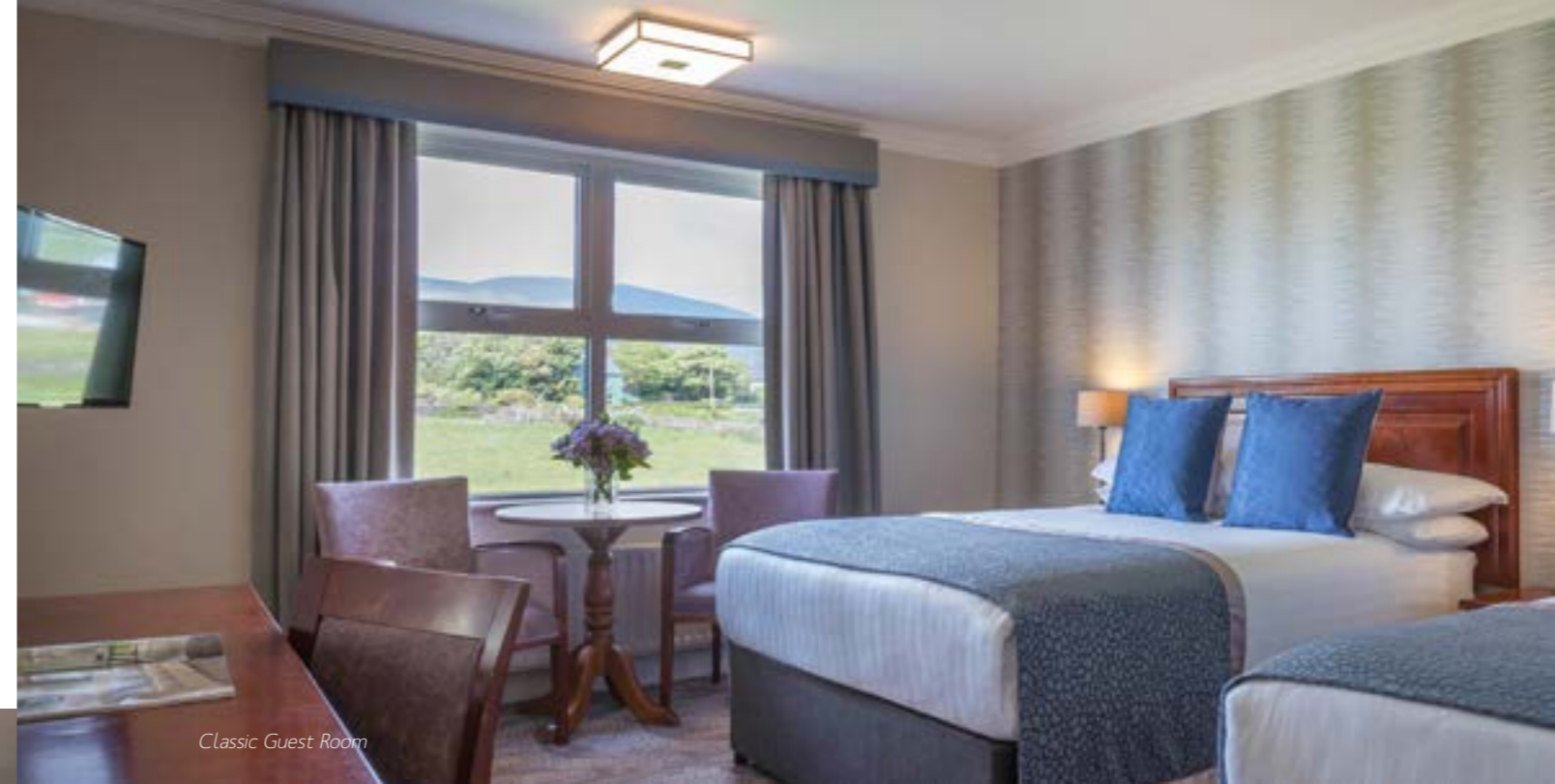
Classic Guest Room

Our reservations team lead by Sheila O'Connor, will maintain a block booking of guest rooms at a special wedding rate, for weddings of more than 100 guests.