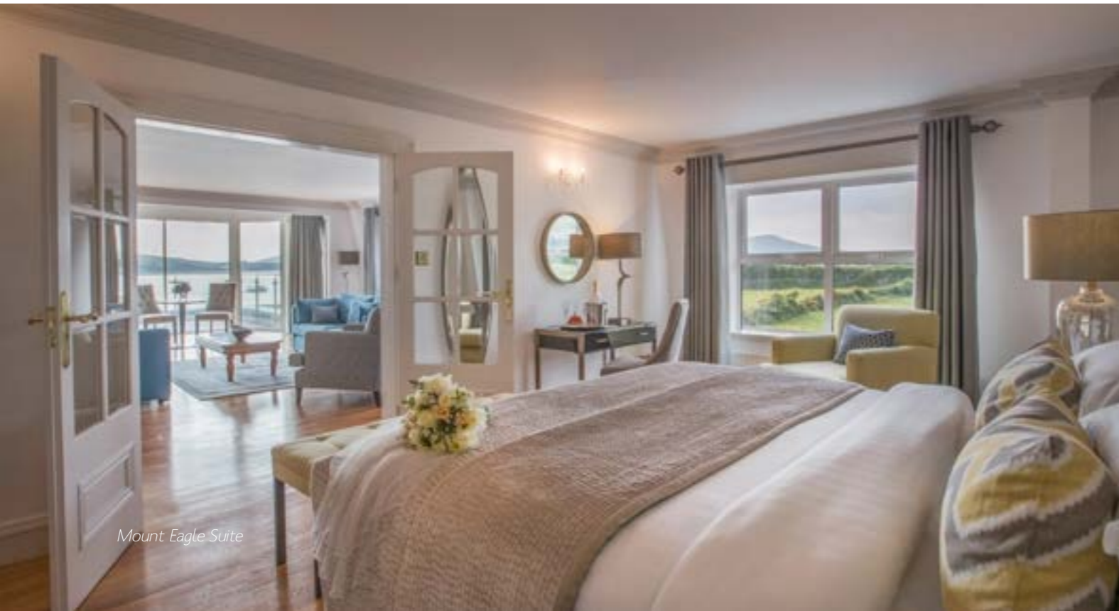
Mount Eagle Suite

Here at the Dingle Skellig Hotel we hold 25 guest rooms at a special discounted rate for your family and friends. To assist you with bookings we issue you a personalised wedding code which enables your guests to book one of these 25 discounted rooms. Rooms can be booked online at www.dingleskellig.com to avail of the special rate we extend to you.